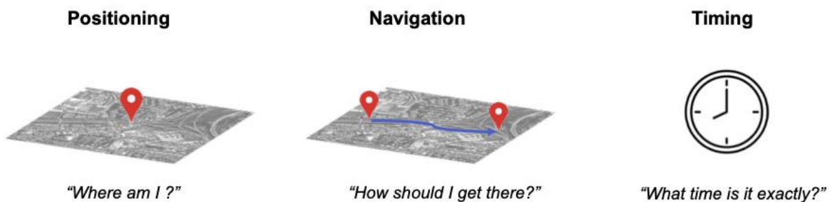
Figure 1. Positioning, Navigation and Timing (PNT)

Global Navigation Satellite System (GNSS) refers to any satellite constellation that provides global positioning, navigation and timing (PNT) services. There are currently four GNSS constellations in operation or in deployment phase: GPS (USA), GLONASS (Russia), BeiDou (China) and Galileo (Europe). These are complemented by several regional GNSS which is called RNSS, including QZSS (Japan), NavIC (India) in operation, and KPS (Republic of Korea) in development phase. PNT and GNSS are acronyms that often seem to be used interchangeably when talking about satellite positioning and navigation.